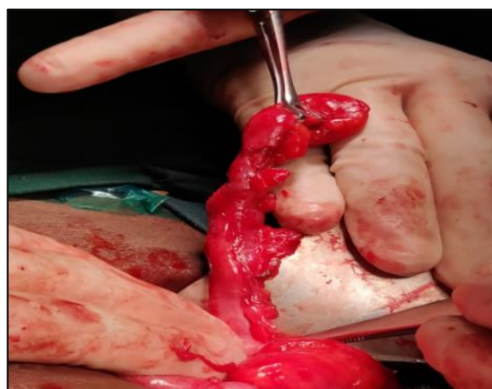
Figure 3: Intra-operative inflamed appendix- Long, tubular structure with increased diameter.