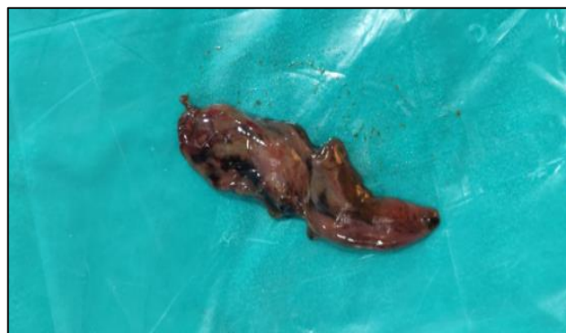
Figure 2: Gangrenous appendix.