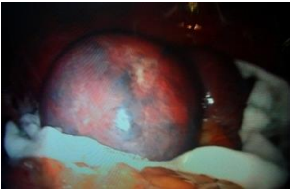
Figure 2: Intra-operative image.