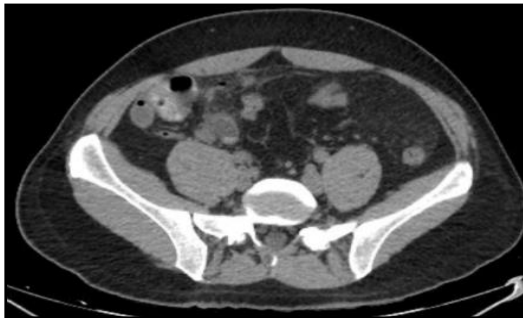
Figure 2: Double contrast (oral and iv) abdominal and pelvic CT scan which reveals the presence of a sacular image which arises from the antimesenteric portion of the terminal ileum, suggestive of a Meckel's diverticulum.