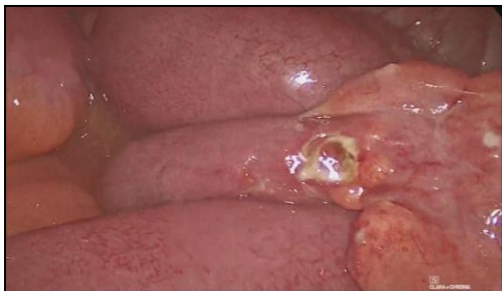
Figure 4: Perforated Meckel's diverticulum in the antimesenteric portion of the lower third of the terminal ileum.