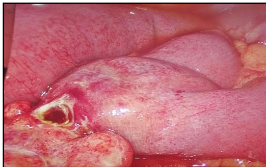
Figure 3: Meckel's diverticulum in the antimesenteric portion of the terminal ileum with a perforated ulcer on its lower third portion.