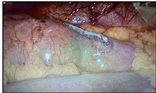
Figure 6: Adequate lumen with passage of liquid and gas through stapler line; reinforcement of the stapling line with fibrin sealant,