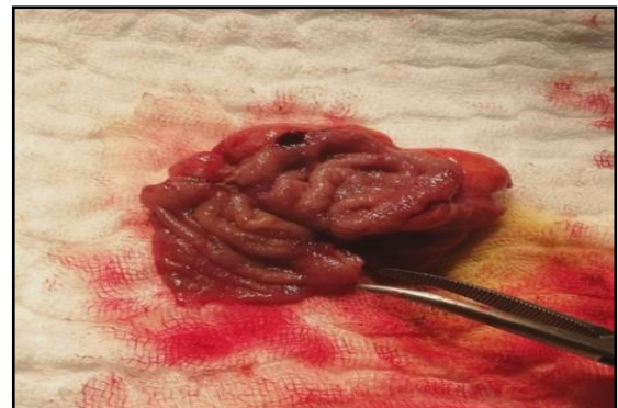
Figure 7: Meckel's diverticulum with ectopic gastric mucosa lining its lumen. Adequate resection margins were observed.