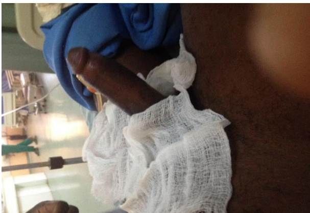
Figure 1: Stuttering priapism with erect penis.

He was admitted into the intensive care unit (ICU) and on the day 2nd post-operative he started having recurrent penile erections up to a total of 4 episodes at intervals of time varying from 1 to 3 hours. The urologist was invited and who made a diagnosis of stuttering priapism. In addition to the continuation post-operative intravenous fluids, he had aspiration of the corpora cavernosa with the resultant penile detumescence. There were no more episodes of penile erections. He underwent post-operative physiotherapy for the quadriplegia for which he showed full recovery of power in all the limbs nine months post operatively. Patient during subsequent had normal erectile function. Histology of the surgical specimen concluded it to be that of schwannoma.