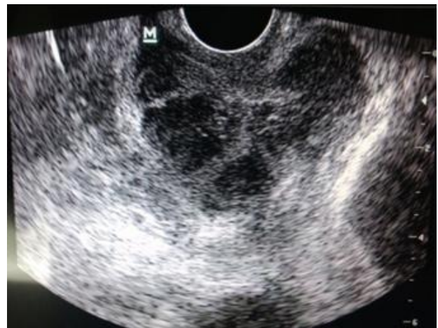
Figure 2: TRUS showing hypoechoic lesion.