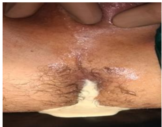
Figure 3: Purulent drainage after TRUS drainage.