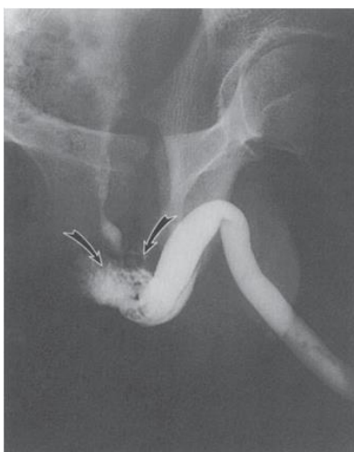
Figure 1: Ruptured urethra. Extravasation of contrast medium around the membranous urethra (arrows).

It is an invaluable test to evaluate and document the stricture (Figure 1). Performed as an out-patient X-ray procedure and can indicate the number, position length and severity of stricture. It involves insertion of contrast dye into the urethra at the tip of the penis.