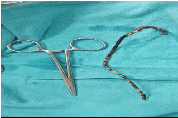
Figure 4: DJ stent retrieval done by open surgery after failure of endoscopic approach.

removal which included one patient with 10 years period of indwelling DJ stent. For proximal renal calculus, PCNL was done in nine patients while URSL was done in 15 patients. One patient required conversion to open ureterolithotomy after PCNL and cystolithotripsy combination failed. ESWL with cystolithotripsy was done in eight patients, however, ESWL along with URSL was performed in five patients. Two patients were managed by cystolithotripsy. Two patients required nephrectomy as their renal unit had become nonfunctional (Table 2).