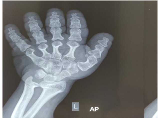
Figure 3: X-ray hand in achondroplasia.