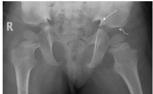
Figure 4: Pelvis radiograph in achondroplasia, shows, square shape of the iliac bone, horizontal acetabular roof (squiggly arrow), and rhizomelic shortening of the femur.

There is symmetrical shortening of all long bones, with proximal portions being more affected and lower limb involvement being more than the upper limb (rhizomelia). There's relative flaring and splaying of metaphyses with normal epiphyses. There is increased gap between 2 nd and 3 rd digit of hand and inability to approximate them in extension leading to appearance of trident hand (Figure 1-4). 17