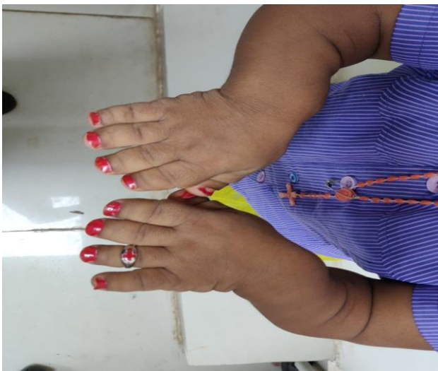
Figure 2: The spatulated, trident hand.