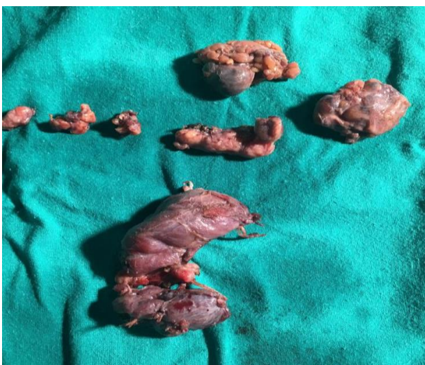
Figure 1: Post-operative specimen, thyroid gland with lymph nodes.