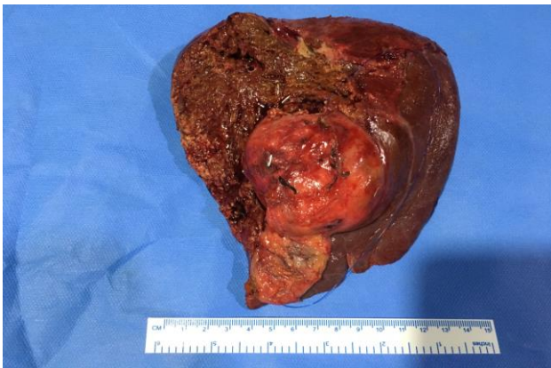
Figure 4: Right hepatectomy specimen showing the aneurysm.