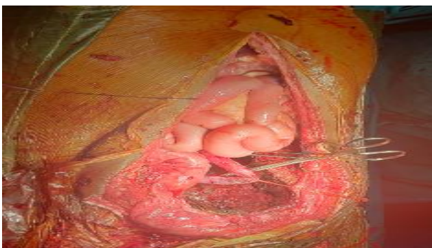
Figure 2: Post excision.