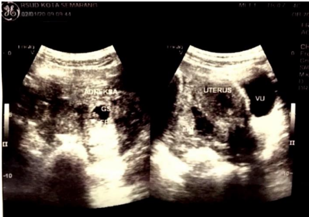
Figure 1: Abdominal sonography examination.

findings confirmed that the patient has an ectopic pregnancy.