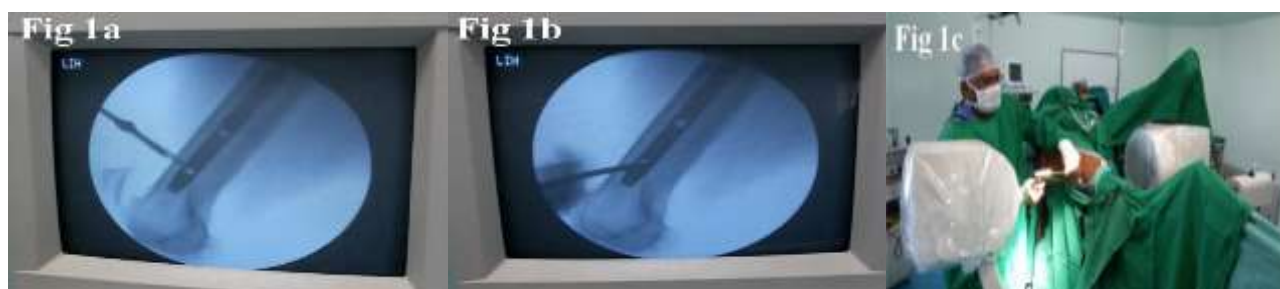
Figure 1a: Skin incision on free hand technique. Figure 1b: Hammering along the line of distal screw hole. Figure 1c: Hammering of steinmann pin for distal screw fixation.

By our novel method there is reduction of 71.4 percent in time consumption and 55.5 percent reduction in fluoroscopy shots.