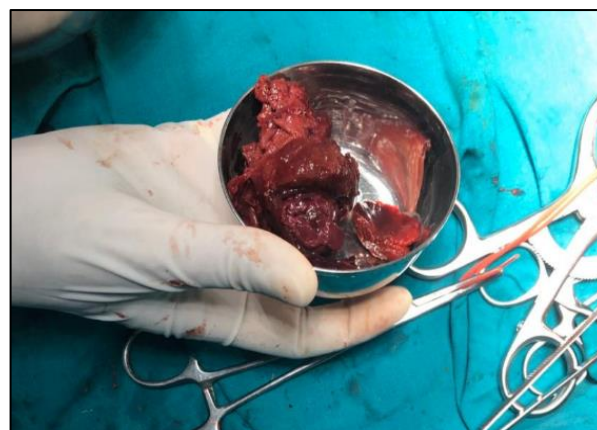
Figure 3: Excised giant thrombus from femoral artery aneurysm.