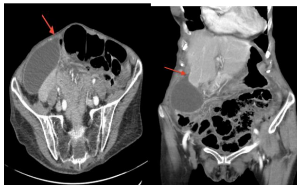
Figure 1: Coronal and sagittal CT slices demonstrating “beak sign” (red arrow) with distended gallbladder.

23.88 \times 10^9/l , neutrophils 20.63 \times 10^9/l and C-reactive protein 58 mg/l. A contrast enhanced computed tomography (CT) scan of the abdomen was performed which demonstrated a distended gallbladder with stranding within the mesentery, shown in Figure 1.