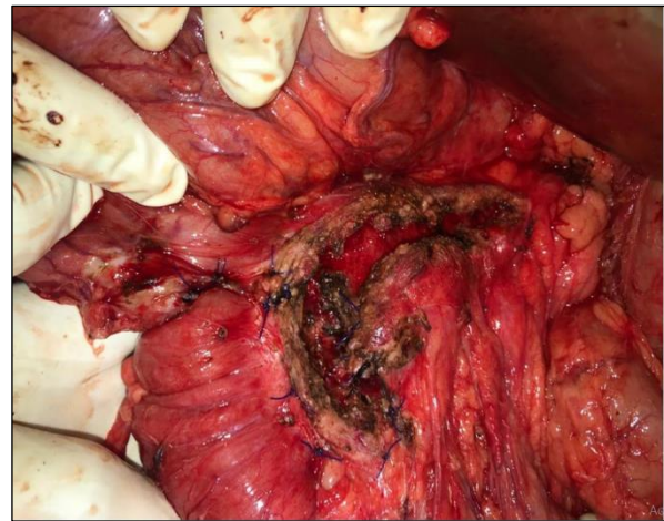
Figure 1: Frey’s procedure after coring.

Three patients underwent cholecystectomy along with Frey’s procedure due to associated gall stones, one patient underwent splenectomy along with Frey’s due to splenic vein thrombosis and left sided portal hypertension (Table 2).