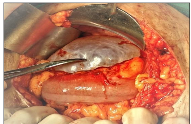
Figure 1: Retroperitoneal cyst displacing descending colon anteriorly.

smoothly marginated homogenous non-enhancing unilocular cystic lesion with attenuation of 4-5 HU in retroperitoneum in left lumbar region displacing the descending colon anteriorly, measuring approximately 7.8×6.7×12.6 cm with attenuation of 20-25 HU (Figure 4). No septations seen within. No solid component seen. No mural nodularity is seen. It is separated from the pancreas, left kidney and ovary.