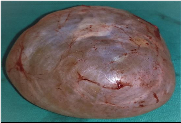
Figure 2: Resected specimen.