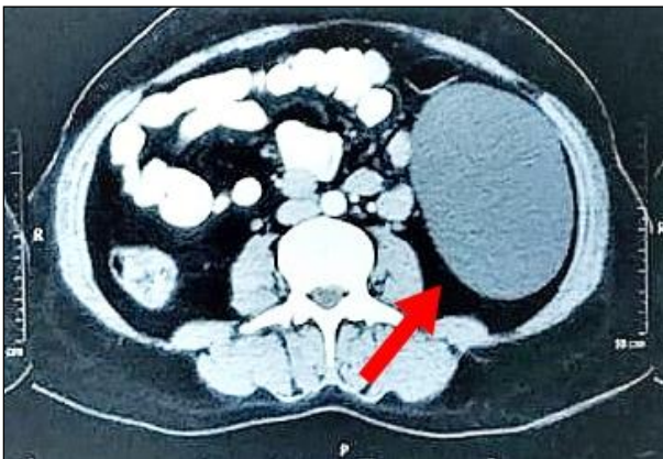
Figure 4: CECT abdomen (transverse section) showing non enhancing unilocular cystic lesion.

On laprotomy, the cyst was found to be located behind the posterior peritoneum of the descending colon. The white line of Toldt was divided to expose the cystic mass (Figure 1). It had not invaded any adjacent organs. The retroperitoneal tumor was completely removed, without spillage of its contents. A huge retroperitoneal cyst measuring 9×8×8 cm grey-white in color having vascularised walls and containing clear mucinous fluid was excised (Figure 2). Histopathological assessment