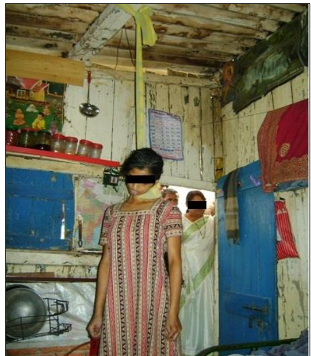
Figure 2: Complete hanging.