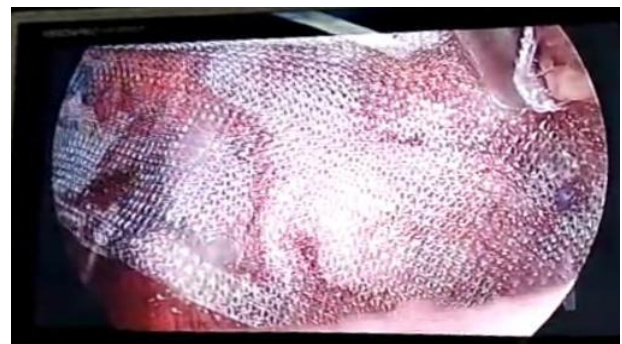
Figure 3: Post mesh fixation view (both medial and lateral fixation done).