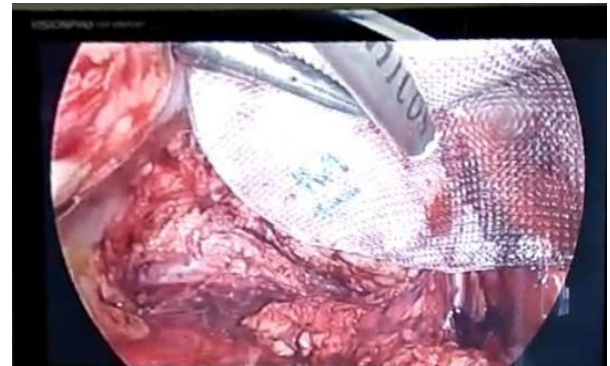
Figure 2: Mesh placement (3D mesh) with medial fixation over pubic tubercle.

Triangle of doom is formed by (A): Lateral boundary, (D): Lateral boundary and (C): Inferior boundary. Contents are formed by E.