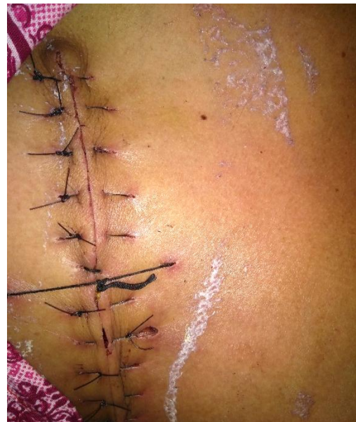
Figure 2: Depicting post skin closure, with tension sutures (removed after 48 hours) in place for approximation of skin flaps.

such as SSI, flap necrosis were noted and other complication in both groups were also noted and managed according to clinical situation.