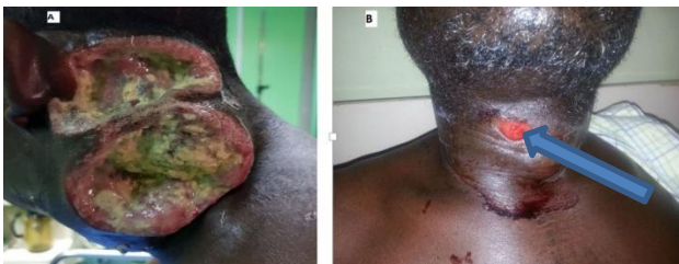
Figure 2: Male patients with cervical lymphoma with cutaneous ulceration initiated by traditional healer's incision and drainage (A) and (B) papillary thyroid carcinoma with site of incision and drainage (arrow) made by the traditional healer.

Eighty-seven (73.7%) patients received treatment at the tertiary hospital: primary chemoradiation 56 (64.4%), surgery alone 15 (17.2%), surgery combined with chemotherapy +radiotherapy 8 (9.2%), and chemotherapy alone 8 (6.8%). Thirty-one patients (26.3%) signed against medical advice.