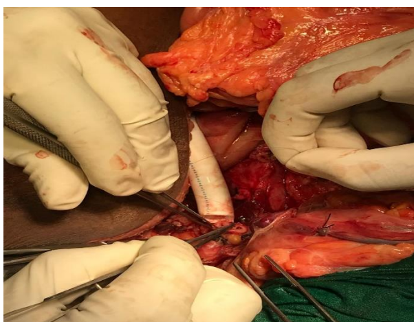
Figure 2: Anastomosis of IVC to dacron vascular graft.

The right kidney, its artery, vein and ureter could not be made out separately. Inferior vena cava was completely encased and occluded by the tumor, hence could not be delineated separately from the tumor. The inferior vena cava above the iliac bifurcation to the infra-hepatic part was excised enblock with tumor. The resected tumor was 25×25×20 cm in size. The cut surface of the mass showed grey white to grey yellow areas with right kidney, its vessels and ureter embedded within. The resected part of the IVC was reconstructed using dacron graft as shown in Figure 2 and 3, the abdomen was closed in layers after placing two drains.