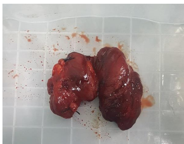
Figure 4: Total thyroid gland.