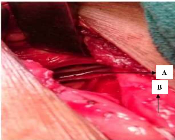
Figure 2: Neck exploration (ET tube visible). (A) Endotracheal tube (visible), (B) esophagus (retracted laterally).

Different modes of injury to the trachea described in the literature are direct surgical injury, fistulisation due to local peritracheal infection, ischemic injury secondary to extensive dissection or endotracheal cuff. 11 We have experienced of 3 cases of iatrogenic tracheal injury in our institute following direct surgical injury in 2 cases (Figure 1) and endotracheal cuff injury during double lumen intubation in one case (Figure 2).