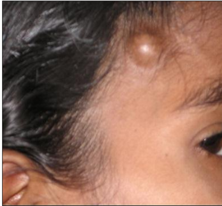
Figure 1: Clinical presentation of scalp swelling.

the anterior branch of the right temporal artery with no intracranial extension and no other aneurysm. A radiological diagnosis of pseudoaneurysm was proposed (Figure 2 and 3). The child underwent surgical exploration and ligation and division of the feeding vessel with excision of the aneurysm. The postoperative recovery was uneventful. The histopathological report was pseudoaneurysm. The final clinical diagnosis made was traumatic pseudoaneurysm.