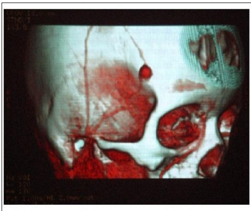
Figure 2: The picture on CT angiography.