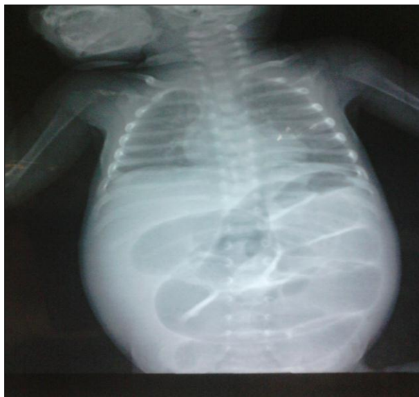
Figure 1: A supine radiograph showing dilated small bowel loops with absent colonic gas in distal small bowel obstruction.

Any bilious emesis in a previously well newborn or infant is considered to be malrotation of gut with MGCV, unless proven otherwise. Antenatal sonological finding of polyhydramnios suggests congenital bowel obstruction. 4 Upper GI contrast study is reserved for partial upper GI obstruction (duodenal stenosis or MGCV) and contrast enema is commonly used for lower GI obstruction [ileal atresia/meconium ileus/Hirschsprung's disease (HD)]. 4,5