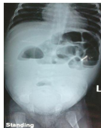
Figure 3: An erect radiograph in a neonate with ileal atresia showing multiple air fluid levels with no gas beyond.