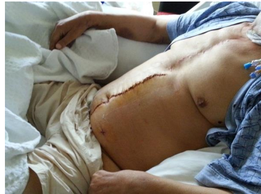
Figure 3: Postoperative imagine.

legs of the graft were tunneled to the femoral arteries and subsequently intervened. After obtaining distal pulses and hemorrhage control operation ended uneventfully. Postoperative recovery was uncomplicated and he discharged from cardiovascular surgery service on the 10th day with no complaints in good health (Figure 3). Histopathologic study was clear.