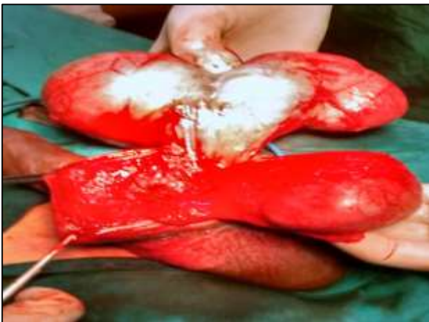
Figure 3: Microscopic section showing dilated lymphatic spaces some filled with eosinophilic lymph fluid separated by fibrous septa. Some septa show lymphoid aggregates.

Laboratory tests were within normal limits. Surgical exploration was performed via a left inguinal incision revealed a large cystic mass with multiple septae located in the left scrotal sac, densely adherent to the tunica but easily separable from the left testis and epididymis (Figure 2). Complete excision of the mass was performed. Postoperative period was uneventful. Histopathology examination confirms the diagnosis of a cystic lymphangioma. On the section, the tissue was spongy and extruded minimal lymph like fluid. Microscopically, the tissue comprised numerous