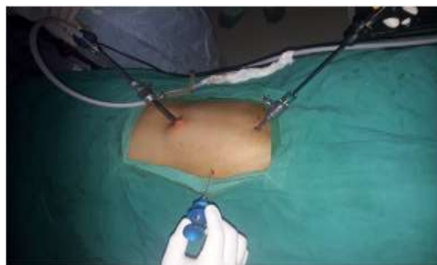
Figure 2: Needle suture grasper in right iliac fossa.