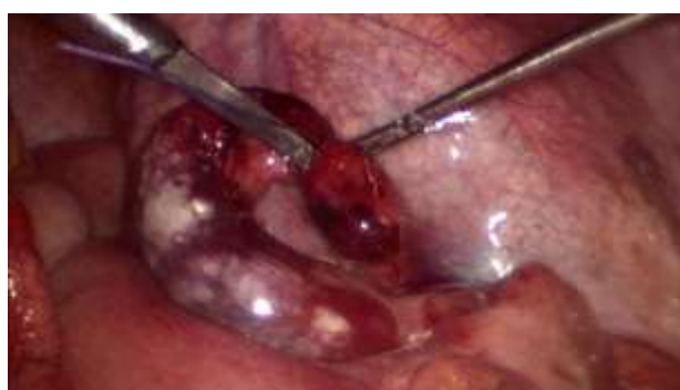
Figure 3: Appendix held by needle suture grasper and used as traction.

The outcome factors evaluated were operative time, intra-operative and post-operative complications, post-operative pain on first day and cosmetic score and cosmetic satisfaction after one month. Descriptive statistics like mean, standard deviation and table were used for demographic and clinical data. The baseline features of the two groups were compared to ascertain the equality of the two groups. The continuous variables were analysed by student t-test or Mann-Whitney U test and depending on the normality of the data and categorical variables by Fischer exact test or Chi-square test. The study had ethical clearance from IEC of the institution.