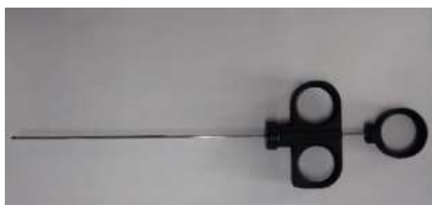
Figure 1: Needle suture grasper.

The study factors were two surgical procedures, needle port assisted two port laparoscopic appendicectomy (Figure 1-3) and conventional three port laparoscopic appendicectomy. Patients were allocated to the two groups non-randomly i.e. two surgical units carried out needle port assisted two port laparoscopic appendicectomy and rest three units did conventional three port procedure. From a cosmetic viewpoint, the conventional three-port laparoscopic appendicectomy technique has the umbilical and supra-pubic port sites which are hidden by natural camouflages, the right iliac fossa (RIF) port is the only visible external sign of surgery. In conventional three port laparoscopic appendicectomy umbilical and supra-pubic port site are hidden by natural camouflage and only right iliac fossa port is visible. This was omitted in needle port assisted two port laparoscopic appendicectomy.