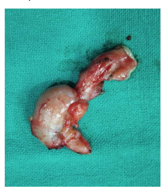
Figure 1: Dilated mid portion of appendix with faecalith inside it.

large Faecolith of 2.1 cm×1.5 cm (Figure 2). Postoperative period was uneventful and Patient was discharged on 3<sup>rd</sup> post-operative day. The histopathological examination report was suggestive of appendix of 21 mm in largest diameter with changes of chronic appendicitis with zones of acute appendicitis secondary to faecalith.