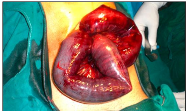
Figure 3: Intraoperative image of gangrenous bowel.

In this study of the 23 patients, diagnosed with ischemia 22 patients were operated. One patient had evidence of ischemia radiologically and was treated with anticoagulants and discharged. Exploratory Laparotomy was performed in 22 patients, ischemic or gangrenous segment of bowel (Figure 3) was resected and sent for histopathological analysis. All histopathological analysis was consistent with findings of ischemia or gangrene.