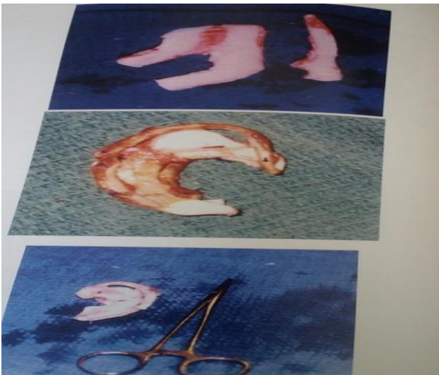
Figure 3: Framework fabrication.