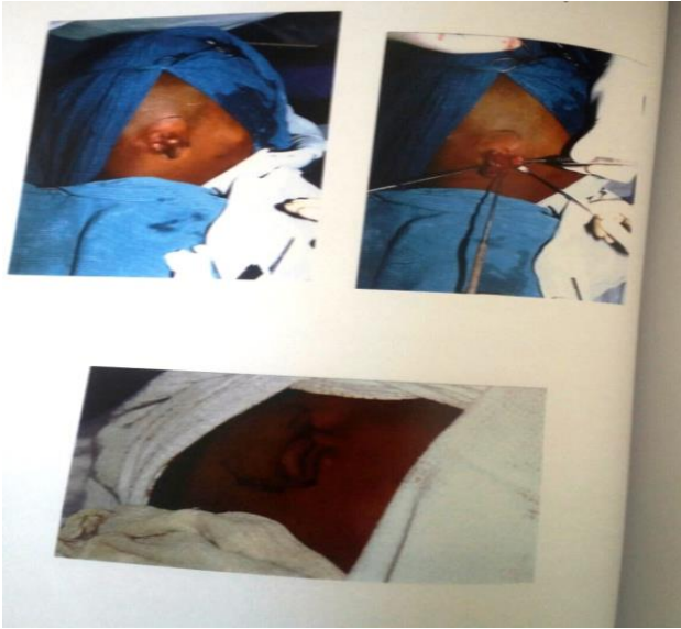
Figure 2: First stage auricle reconstruction subdermal pocket creation.

body. After removal of the cartilage the wound is flushed with saline and the anesthetist provided positive pressure to the lungs (Figure 3).