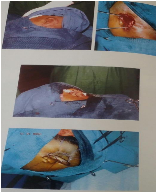
Figure 7: Third stage of auricle reconstruction - creation of cephaloauricular sulcus.

Three months after the initial surgery ear cartilage elevation was done. An incision was made 5mm behind the rim leaving behind adequate soft tissue over the posterior surface cartilage framework and the framework is elevated until the correct amount of projection is achieved. The retroauricular skin is advanced into the newly created sulcus and the full thickness skin graft from groin is applied over the postauricular defect. To secure the graft, the sutures are left long and tied over a gauze bolster dressing.