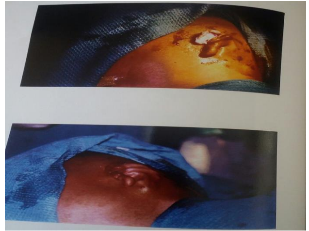
Figure 4: Implantation of the framework.

After the framework fabrication, the framework implantation was done through a small preauricular incision anterior to auricular vestige, a thin flap is raised by sharp dissection, care being taken to preserve the subdermal plexus. Insertion of the framework into the cutaneous pocket takes up the valuable skin slack that was created when the native cartilage remnant was removed. The dressing was applied accurately confirming the convolutions of newly created auricle (Figure 5).