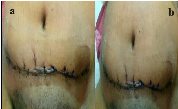
Figure 4: (a) defect closed by secondary suturing (b) closed defect by secondary suturing without using skin grafts or flap.

After induction our patient was placed in the supine position and the general surgery (GS) team started with excision of the necrotic skin including all sinuses, together with aggressive debridement of the necrotic tissues. 200 ml of pus was found. A wide debridement of necrotic area upto the both flanks and to lower pole of umbilicus, down to the suprapubic area was done, which left a big defect in the lower anterior abdominal wall and it was found to be extra peritoneal and no track or sinus was detected which could have connected with the intraperitoneal space. (Figure 2a,2b)