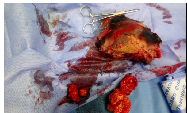
Figure 3: The part of anterior abdominal wall which was removed (wide area of necrotic tissue).

she was resuscitated with IV fluids, O 2 , samples were taken for bloodwork's that showed WBC: 20,000, Hb: 9.8 gm/dl, random blood sugar was 18, creatinine 130 micromol /l and urea 8mmole/l. PT, PTT, INR were: 15 sec, 46 sec, 1.9 respectively, serum calcium: 1.9 mmol /l and albumen: 25 gm/l. An impression of neglected necrotizing fasciitis of lower anterior abdominal wall was made, and patient was prepared for contrast enhanced computerized scan (CECT) of abdomen, which showed no signs of extension of the infection to the intraabdominal cavity. Patient was seen by medical, endocrinologist, nephrologist, psychiatric, neurosurgery, anesthesia. Patient was stabilized soon in high dependency unit. The situation was discussed with her husband and she was consented for high risk under general anesthesia.