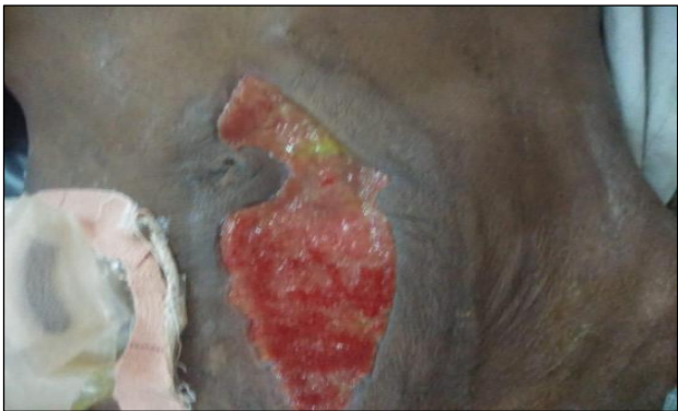
Figure 5: A case of complete fascial disruption which was managed by skin closure only.

Closure of burst abdomen in 60 (75%) cases was achieved by re-suturing of the fascia with number one polypropylene suture (prolene) under general anaesthesia with proper relaxation, broken and cut suture material was removed, abdominal cavity was explored as far as possible to assess the underlying pathology (Figure 4). Fascia was closed either by continuous or interrupted manner depending on the case. Mesh was not used in any case due to fear of mesh infection. In remaining 20 (25%) patients fascia could not be approximated due to severe bowel edema, retraction and destruction of fascia and continuing wound infection.