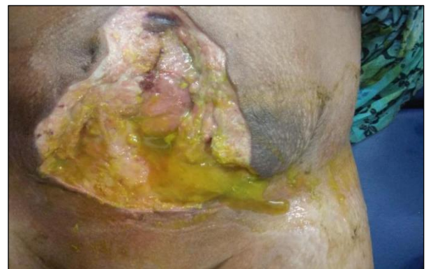
Figure 2: A case of complete wound disruption with evisceration due to anastomotic leak following ileoileal anastomosis.