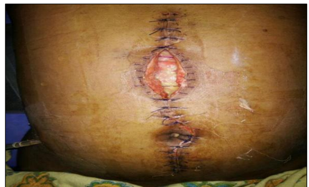
Figure 3: A case of complete wound disruption due to severe postoperative bowel edema.

After the confirmation of diagnosis all cases were studied carefully with regard to age, risk factors, method of primary closure of fascia and postoperative complications were analyzed. In all cases initial laparotomy was done by mid line incision and was closed by continuous suturing using non-absorbable, no. 1 polypropylene suture which included peritoneum and fascia in a single bite. Skin closure was not done in few cases due to heavy