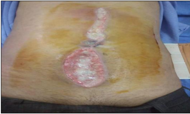
Figure 4: A case of complete wound disruption following laparotomy for peritonitis, closed by fascial closure.

contamination of wound which was closed later by delayed primary suture.