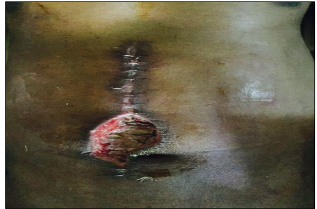
Figure 1: A case of partial wound dehiscence following laparotomy for blunt abdominal trauma.

Out of 202 laparotomies 150 patients underwent emergency laparotomies and 52 were elective laparotomies. 80 patients presenting as gaping of abdominal wound with or without evisceration were included in the present study (Figure 1, 2 and 3).