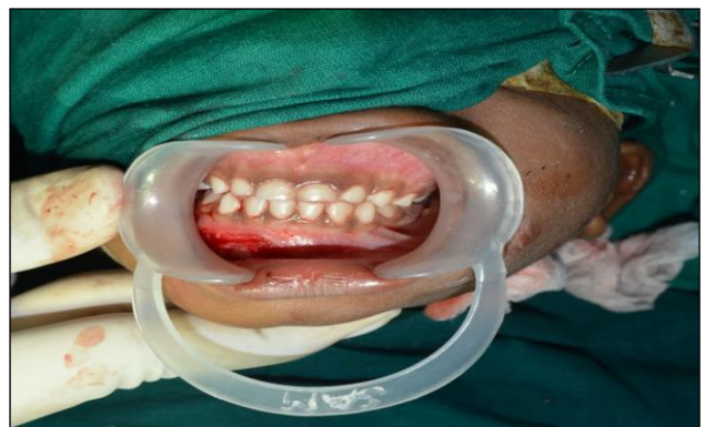
Figure 5: Good occlusion achieved.

The fractured angle was plated extra orally with a stainless-steel plate and screws taking into concern the tooth buds situated in that region (Figure 2). With the help of the CT images we were able to place the plate below the tooth buds.