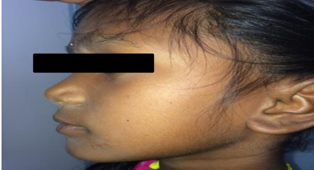
Figure 7: Minimal scar present.

Post-operative orthopantomography (OPG) confirmed the placement of plate and screws below the tooth buds. (Figure 3). There was a mild deviation of the jaw that was corrected with physiotherapy. The patient was under regular follow up and after a period of 8 months, the plates and screws were removed (Figure 4).