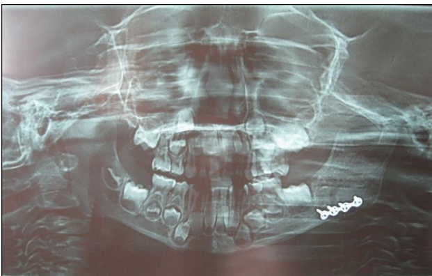
Figure 3: Post-operative OPG showing the miniplate in position.

Under general anaesthesia with nasotracheal intubation, the airway was secured. Local anaesthetic was injected into the left angle region along the preexisting laceration and fractured bone was exposed.