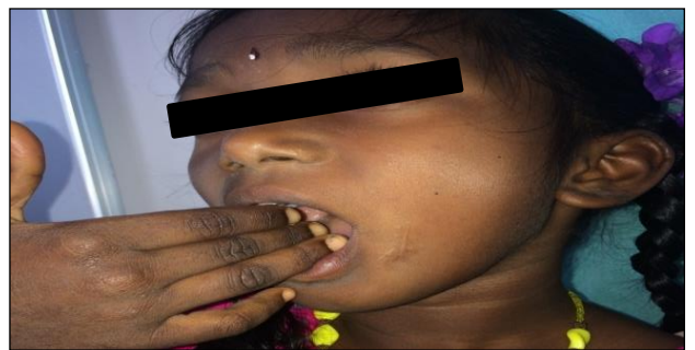
Figure 6: Good mouth opening.

Careful closure of the wound was done. Post closure there was no mobility of the segment and no mobility in the Para symphysis region.