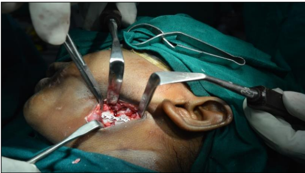
Figure 2: Intra-operative photograph showing the plating of the fracture.

Under general anaesthesia with nasotracheal intubation, the airway was secured. Local anaesthetic was injected into the left angle region along the preexisting laceration and fractured bone was exposed.