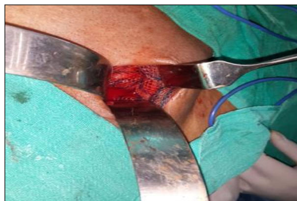
Figure 5: Picture showing mesh after spread

In the present study 15 × 15 cm ULTRAPRO partially absorbable light weight mesh was used in all cases without splitting. Minimizing fixation in this area is important because of the numerous anatomic elements in the preperitoneal space that could be inadvertently damaged during suture or tack placement. Two to three non-absorbable sutures (prolene 2-0 RB) were used to attach the prosthesis to the anterior abdominal wall on 2 or 3 points that is transverse aponeurotic arch, coopers ligament and medial fibrous tissues of rectus.