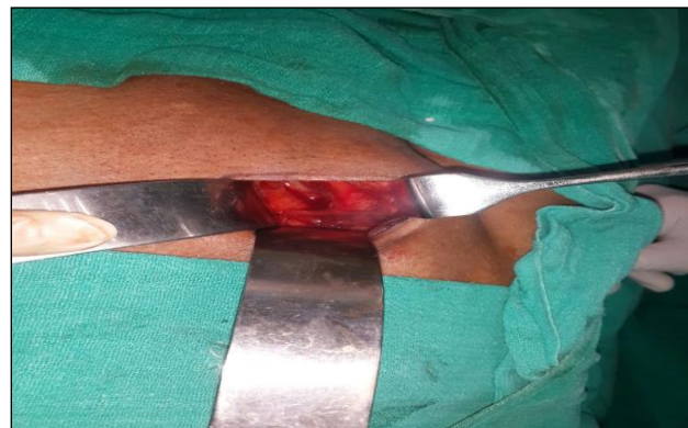
Figure 2: Entry into space of retzius.

A lower midline or Pfannenstiel incision was used in all cases, which extend from the midline 2.5-3.5 cm in each