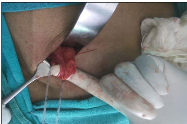
Figure 3: Picture showing cord structures with hernial sac.

direction laterally in midline infraumbilical incision of approximately 8 cm was used. The anterior rectus sheath and the oblique muscles were incised for the length of the skin incision. The lower flap of these structures was retracted inferiorly toward the pubis. The preperitoneal space was entered by incising the fascia transversalis along the lateral edge of the rectus muscle or by incising the fascia overlying the space of Retzius (Figure 2).