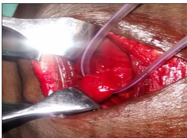
Figure 4: Picture showing indirect hernial sac.

The preperitoneal space was completely dissected to a point lateral to the anterior superior iliac spine. The symphysis pubis, Cooper's ligament, and iliopubic tract were identified. The spermatic cord was "parietalized" (completely dissected) at least 4 cm to provide adequate length to displace it laterally. Direct sacs were reduced in the course of this dissection. Indirect sacs were mobilized from the cord structures and reduced back into the peritoneal cavity (Figure 4). Large sacs which were difficult to mobilize were divided so that the distal part of the sac was left in situ and the proximal portion of the sac was dissected away from the cord structures carefully to avoid damage to the testicular vessels. Any accidental opening of peritoneum was closed with vicryl 3-0 RB.