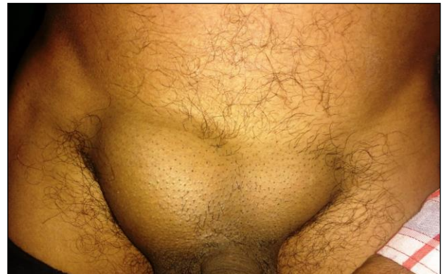
Figure 1: Preoperative pictures of bilateral inguinal hernia.

IV antibiotic (1-gram ceftriaxone) was given to all patients before incision, which was continued post operatively. Painting and draping were done. In the present study, Stoppa procedure was used with slight modifications.