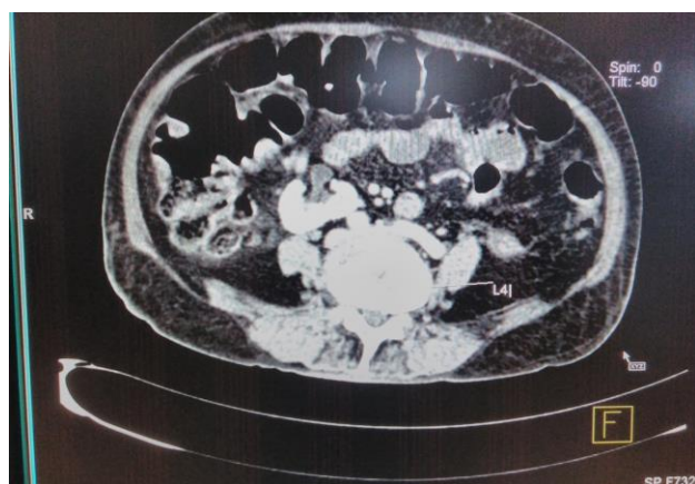
Figure 1: Right ectopic kidney at the level of L4 and L5 lumbar vertebra.

Physical examination revealed a palpable moderately tender discoid shape firm lump (7cm X 10cm) in the right lower half of the umbilical and adjoining hypogastric region of the abdomen. The lump was partially mobile. Other regions of the abdomen were soft and non-tender. Bowel sounds were normal. The genital examination and digital examination were unremarkable.