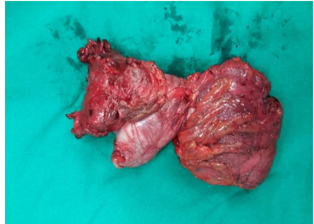
Figure 3: Resected specimen showing part of caecum and appendix.

The base of the appendix was unhealthy and part of the cecum had also herniated through the fascial defect. Thus, a limited right hemicolectomy was performed. Hernia repair was then performed by closing the transversalis fascia and internal oblique muscles primarily. The necrotic external oblique layer was debrided and irrigated copiously, a surgical drain was placed and the skin was closed loosely using staples. The patient subsequently recovered well. Histology revealed a fibro-inflammatory mass with the appendix trapped inside showing features consistent with perforated acute appendicitis (Figure 3).