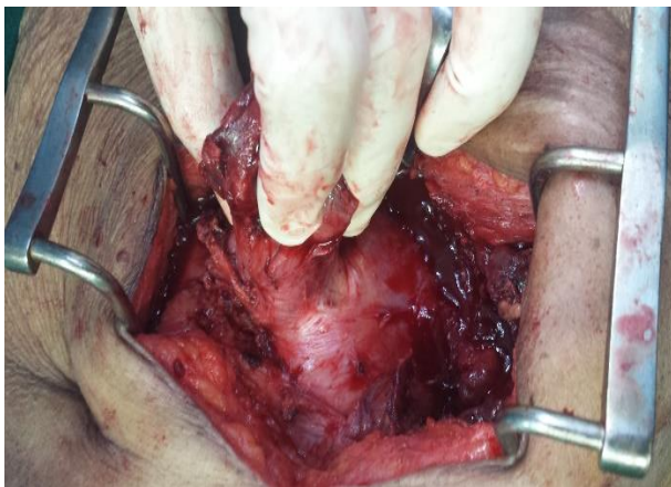
Figure 2: Appendix and part of caecum herniating through fascial defect.

The mass was inseparable from the cecum and hence, a diagnosis of perforated appendicitis was made (Figure 2).