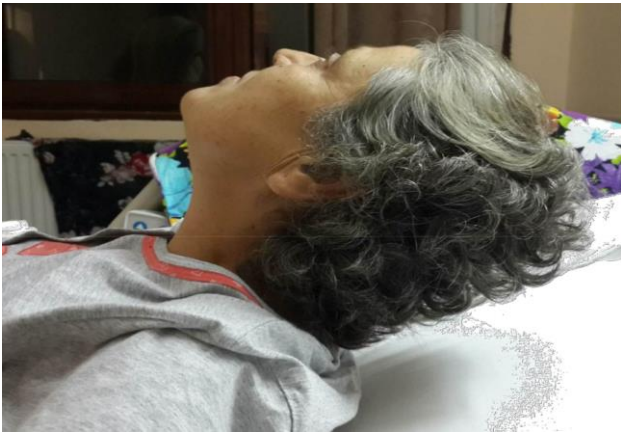
Figure 3: Short thyromental distance and restricted neck movement.

previously undergone surgery of umbilical hernia after failed attempts to achieve general anesthesia with orotracheal intubation using a fiberoptic bronchoscope, so that we planned regional anesthesia for this case. On physical examination she had a full set of teeth, her mouth opening is normal, her chin was barely touching her chest. Mallampati score was 3. Her thyromental distance was 6 cm. Her occiput to wall distance was 18 cm (Figure 3). Ankylosing is a detectable in both sacroiliac joints and there is typical appearance of bamboo spine (Figure 4). The patient was informed about anesthesia methods and she signed an approval for both RA and GA methods. Authors planned epidural anesthesia.