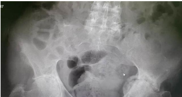
Figure 4: Typical appearance of bamboo spine.

Authors administered midazolam 2 mg intravenously for premedication. The patient was placed in lateral decubitus position for the procedure, an epidural catheter was placed in the L 3-4 interspace in the midline using an 18G Tuohy needle via the saline loss of resistance technique. 0.5% isobaric bupivacaine of 6 mL and 50 µg Fentanyl was administered into epidural space. This resulted in a sensory from T 6-7 .