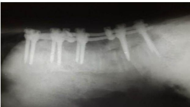
Figure 2: The thoraco-lumbar vertebral column lateral.

Authors induced general anaesthesia with propofol 3 mg/kg and rocuronium 0.6 mg/kg, but neither the introducer tool nor a finger sweep technique was successful in placing laryngoscopy. Due to bleeding in the mouth, anatomical structures couldn't be viewed with fiberoptic bronchoscope. It was unsuccessful. His venous blood gases parameters were pO 2 : 35 mmHg, pCO 2 : 41.9 mmHg, pH: 7.30, haemoglobin: 9.8 g/dL, haematocrit: