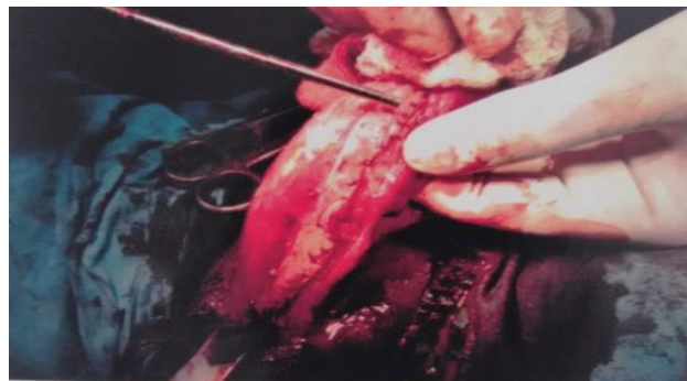
Figure 3: Dorsal onlay graft placement.

Urethral catheter was removed at the end of three weeks and uroflometry was done. Retrograde urethrogram was done at three months. All the patients were followed up at three weeks, three months, six months and at the end of one year. The study was conducted after approval from ethical committee of the institute.