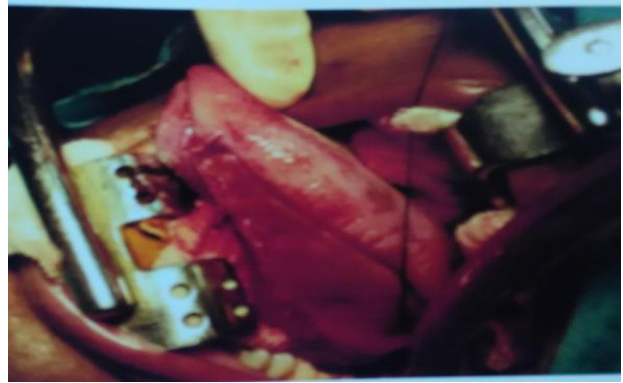
Figure 1: Harvesting lingual mucosal graft.

A 16 Fr. Silicon catheter was used for stenting the repaired urethra which was removed on day 21. Patients were allowed liquids by evening on day one and soft diet by the second day. Full diet was allowed by day 4. Postoperatively graft site morbidity was evaluated on the basis of haemorrhage, swelling, pain, numbness, difficulty in mouth opening, paresthesia, difficulty during mastication, slurring of speech, tongue mobility and altered taste sensation.