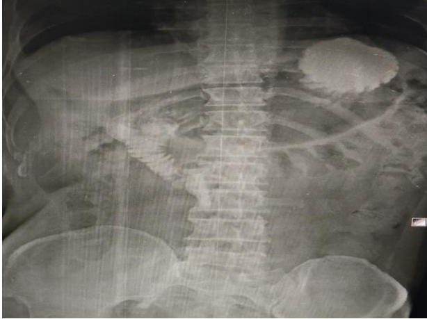
Figure 1: X-ray after completion of PEG, showing contrast in the small bowel. A note of excessively inflated stomach can be made. The greater curvature can be made out easily. The haustra of transverse colon is seen just below the greater curvature of stomach.

tube. We discussed the issue with patient relatives and advised them to undergo replacement of tube under endoscopic guidance but patient attendants refused for the procedure and were not willing to undergo any further procedure and instead wanted a Ryle's tube to be placed through which the feeding could be done.