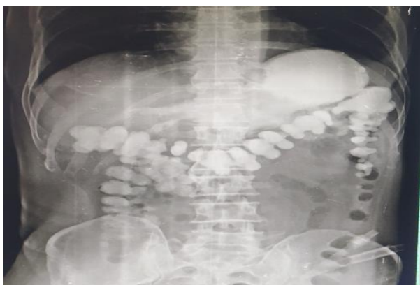
Figure 2: Gastrograffin study after accidental PEG tube removal. The contrast given through nasogastric tube, showed rapid filling of the large bowel.

We agreed to it and keeping in mind the chances of leak from gastrostomy site and developing peritonitis, we advised for a gastrograffin study by injecting dye into stomach through the nasogastric tube to look for any possible leak from previous gastrostomy site. To our surprise whole of transverse colon, ascending and descending colon was seen filling with contrast material (Figure 2).