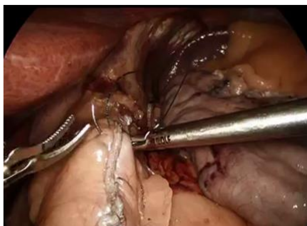
Figure 3: Suture over-sewing of the staple line.

sealing and dividing the short gastric vessels very close to the serosa of the stomach were done. A 32 French oro-gastric bougie was introduced inside the stomach. Author used during present study 2 types of endo-staplers for gastric resection; the Endo GIA (Covidien) and Ethicon endo-surgery stapler. The stomach was stapled starting 4cm proximal to the pylorus till the angle of His. The last used cartridge was placed about 1 to 2cm from the gastro-esophageal junction (Figures 2). The resected specimen was then removed through the site of one the of 12mm ports. After testing for leaks with air and 100ml methylene blue dye, a drain was placed nearby the staple line.