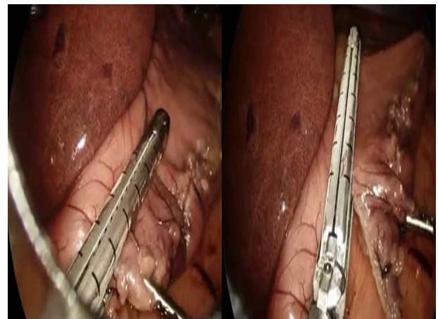
Figures 2: Stapling and gastric resection.

Using the harmonic scalpel, a window was made in the omental bursa approximately 4cm proximal to the pylorus. The antrum was mobilized by dissection and sealing of the gastroepiploic vessels on the greater curvature. The dissection was stopped about 2cm proximal to the pylorus (Figure 1). After mobilization of the antrum, the stomach was retracted inferiorly and toward the patient's right side for better exposure of the cardia, spleen and left crus. Proceeding superiorly,