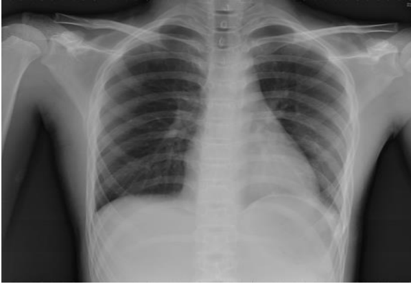
Figure 4: Chest radiograph of the patient after retrieval of the dislodged pectus bar.

The steel bar was retrieved and temporarily fixed to the 6 th rib and the patient was returned to the routine supine position with caution. The surgery was completed in a timely fashion with the steel bar safely removed with ease alongside the steel plate and steel wires which were used to keep it from flipping during the initial procedure without any complications (Figure 4). She was discharged on the 4 th postoperative day.