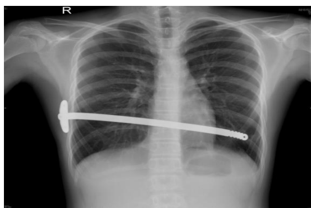
Figure 3: Chest radiograph indicating dislodgement of the supporting bar after pectus repair with slight migration towards the left hemi diaphragm.

However, this did not occur and there were no postoperative complaints from the patient what so ever after discharge from the hospital on the fourth postoperative day. After the patient was discharged from the hospital, he was placed under various restrictions for three months such as not carrying 5kg of load or more involving the upper body trunk and avoiding sporting activities with the twisting of the upper extremities. He was also instructed not to sleep on his chest and abdomen rather in a supine position. On the seventh week after surgery, he visited the department's outpatient clinic as instructed for further routine clinical evaluation with a chest radiograph (Figure 2).