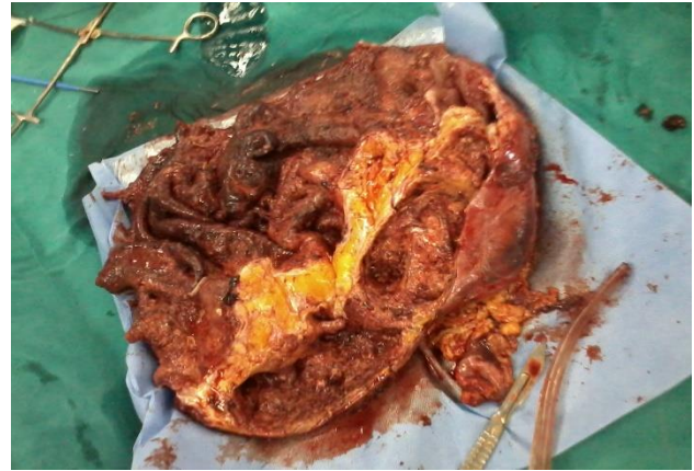
Figure 7: Teratoma on cut section.

Surgery lasted for 4 hours and total blood loss was 400ml. After removal the contents were weighed 12kg including solid and liquid material. The gross appearance of mass is shown (Figure 7). The final status of abdomen after removal of mass is as shown (Figure 5). The tumor mainly consisted of thick walled mass with multiloculated appearance with sebaceous material, hair, skin, cartilage, bone as contents. The histopathology of tumor was of mature teratoma having cartilage, skin, hair, sebaceous material as a content and components, there was no evidence of malignancy.