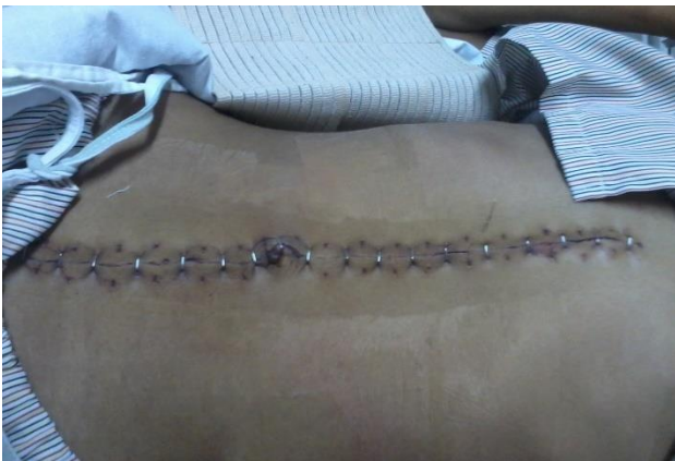
Figure 5: Abdomen after excision of tumor showing left kidney replaced to left renal fossa.