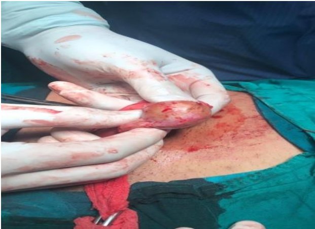
Figure 1: Intraoperative photo of cyst.