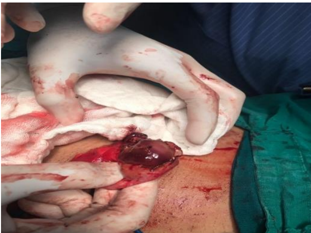
Figure 2: Cyst opened intraoperatively.