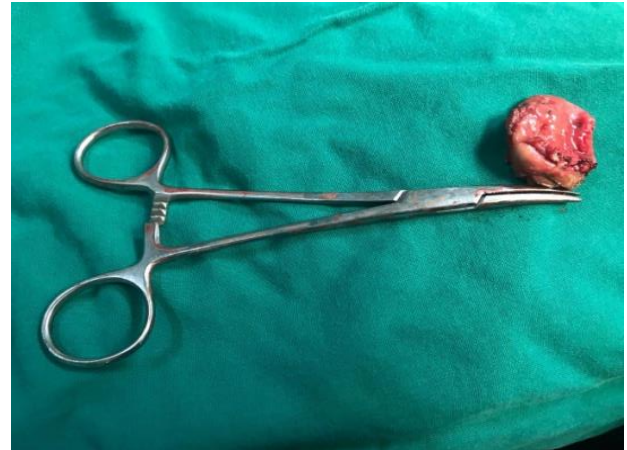
Figure 4: Cyst photo post- op.

structures lined keratinizing squamous epithelium. Sebaceous gland was also seen, there was no evidence of any malignancy. The surrounding fatty connective tissue contained no residual or atrophic testicular tissue. The patient had uneventful recovery.