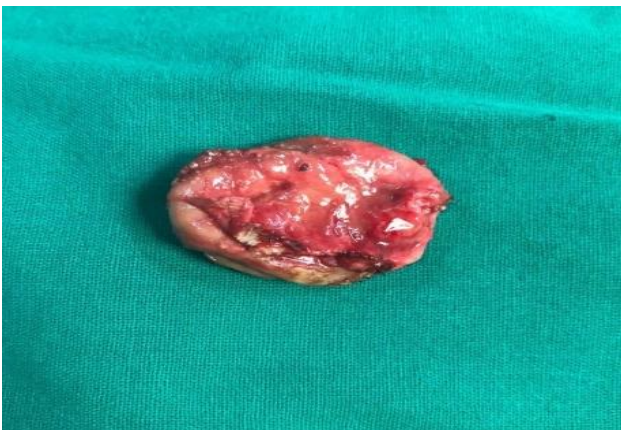
Figure 3: In toto cyst wall.

On mass dissection it was easily separated from the cord. The mass was excised and sent for histopathological examination, we also found indirect sac was transfixied and mesh placement were done.