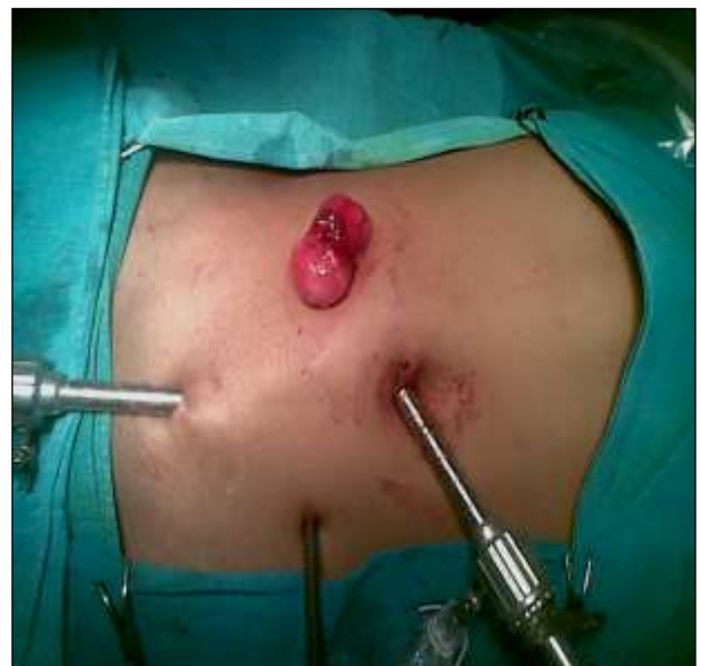
Figure 3: Laparoscopy assisted small bowel perforation repair.

The perforations were treated either by total laparoscopy or Laparoscopy assisted repair. There was single perforation in all patients. Size of perforation was measured with reference to the size of jaws of laparoscopic grasper. Biopsy was taken from the small bowel perforation margin.