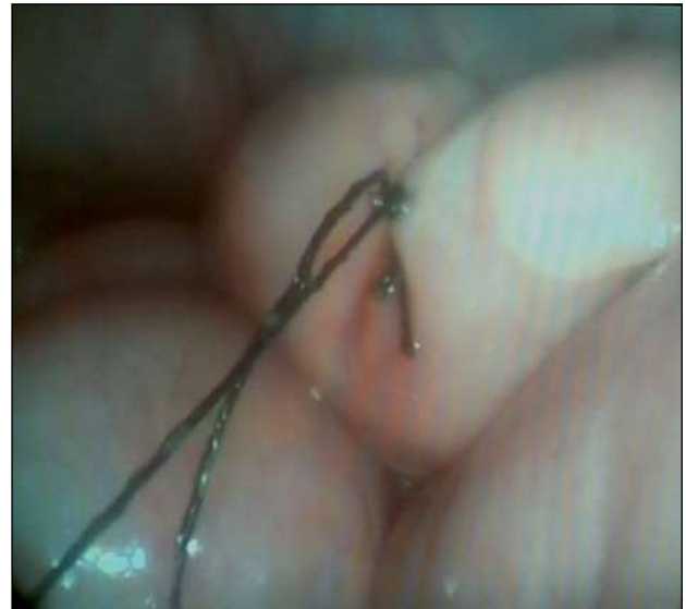
Figure 2: Intracorporeal 2 layer suturing.

collections in various recesses was noted. Remaining ports were placed according to the site of pathology. For proximal perforations 2 working ports were introduced in iliac fossa both side, for distal perforations one working port placed in left iliac fossa and other was in left hypochondrium keeping angle of 60° between them. Additional port can be introduced for suction or retraction (Figure 1).