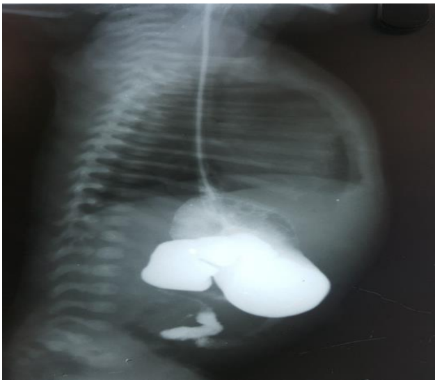
Figure 2: Upper GI contrast suggestive of malrotation.

All the newborns were admitted to surgical NICU and after resuscitation a plain X-ray abdomen was performed. If the plain X-ray abdomen revealed gastro duodenal dilatation and paucity (but not absence) of distal gas, a diagnosis of partial duodenal obstruction was made and patients were subjected to upper GI contrast study. Findings like abnormal position of duodenojejunal flexure to the right of the spine, proximal small bowel loops in the right side of the abdomen and cork screw pattern (s/o volvulus) were taken as diagnostic of malrotation of gut.