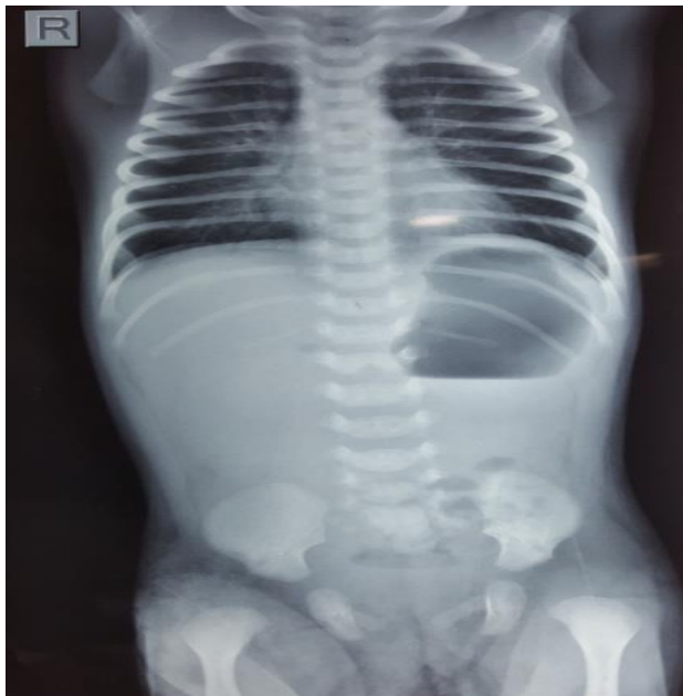
Figure 1: Plain X-ray abdomen showing partial duodenal obstruction.

treated at Department of pediatric surgery, Institute of Child health, Niloufer hospital, Hyderabad.