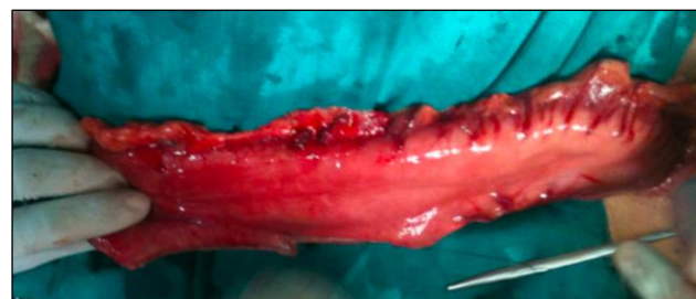
Figure 3: Stomach tube ready to be pulled into neck after subtotal oesophagectomy.