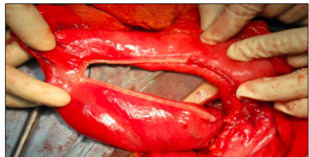
Figure 2: Stomach tube using linear stapler.