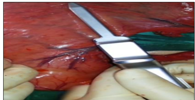
Figure 1: Linear stapler for making stomach tube during esophageal resection.

All the hand sewn anastomosis was performed by an experienced surgeon who did almost more than 100 gastrointestinal anastomosis with either single layer or double layer/interrupted or continuous technique of anastomosis using 3-0/2-0 polyglactin (vicryl). In the double layered technique, 3-0 silk was used for outer seromuscular layer. A full standard exploration was done as per the pathology under necessary anesthesia decided by anesthesiologist. Staplers used in Anastomosis are Linear cutting staplers (TLC 55,75), Linear anastomosing staplers (TCR 55,75), Endoluminal anastomosing staplers (CDH 29,33).