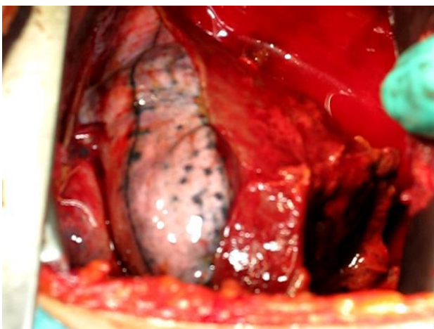
Figure 3: Lung Parenchyma Visible after decortication.

The most frequent habits included 31 (55.3 %) patients with alcoholism, 27 (48.2 %) smokers. Co-morbidities consisted of 4 (7.1 %) patients with diabetes mellitus type