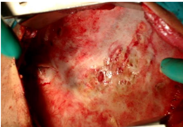
Figure 2: Thick pleura - no visible lung parenchyma, no visible lung.