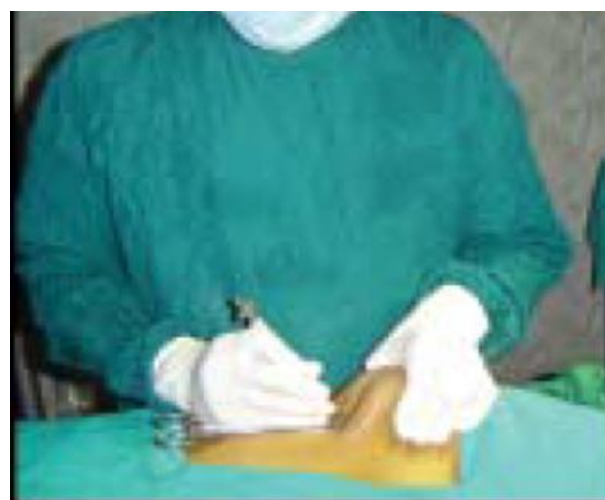
Figure 1: Veress needle entry.

sheath. The little finger is then introduced through this incision, and the preperitoneal fat and the peritoneum are perforated with the finger, which is also used to explore the area around the incision for adhesions. Alternatively, the peritoneum is gently entered with the tip of closed artery forceps, while keeping the abdominal wall elevated with Allis forceps or towel clip applied to the umbilical scar. The blunt tip cannula (Hasson's) is inserted through the incision, or in its absence, the metallic or plastic cannula without the trocar is used. The cannula is fixed to the abdominal wall with a silk thread after placing wax gauze around it and the skin edge to prevent air leakage. The creation of pneumoperitoneum is faster and uniform with the open laparoscopic technique. So, this study will show the comparison and benefits between two methods of intraperitoneal access to create pneumoperitoneum. i.e. Intraoperative time, complications, Post-operative recovery.